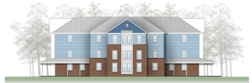
3939 CAROLINA BEACH ROAD GOOD SHEPHERD 09/06/2022