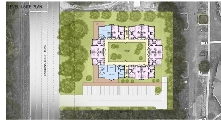
3939 CAROLINA BEACH ROAD GOOD SHEPHERD 09/06/2022

Good Shepherd intends to build approximately 32 units of Permanent Supportive Housing on this site.